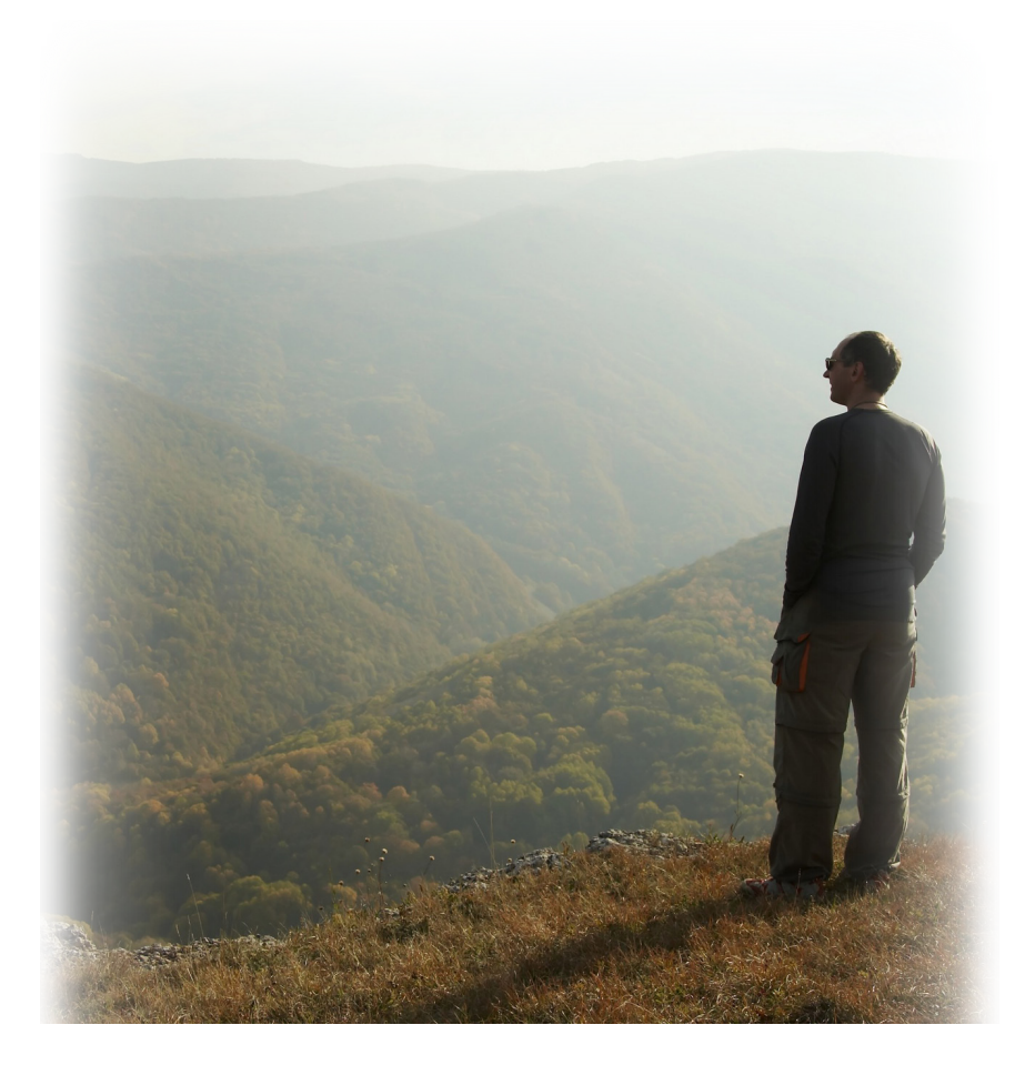
Your Friend, An adult child of an alcoholic parent

On the next page, I want to tell you some things about alcoholism that I wish someone had told me when I was a kid. Maybe these things will help you understand a little bit better, and maybe you won't blame yourself the next time your parents drink too much or use drugs.